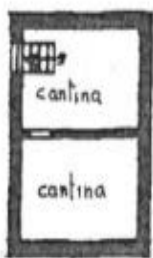
Pianta Piano Seminterrato H. 2.40