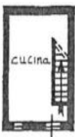
Pianta Piano Terreno H. 2.60