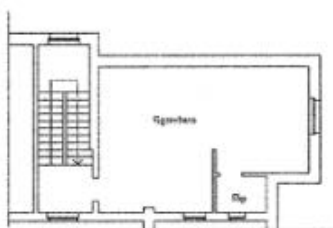
PIANTA PIANO PRIMO H = 200 CM