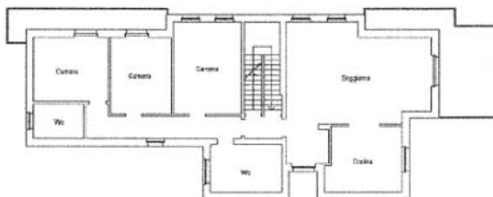
PIANTA PIANO TERRA H = 300 CM

Latitude & longitude: 44.818710169447 | 8.292309709666128